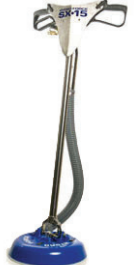
Hydroforce SX Series

Upgrade your TCS truckmount system to 2000 PSI for hard surface cleaning. Package upgrade includes XP Little Giant heater and Emperor 1813 pump to maintain high heat and maximum pressure.