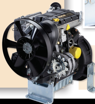
23.4 HP Kohler Diesel High-Speed Open Power Unit