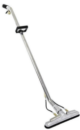
WESTPAK HARD SURFACE 14" WAND