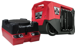
AIR SCRUBBERS & DEHUMIDIFIERS