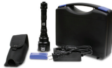
URINE DETECTION LIGHT