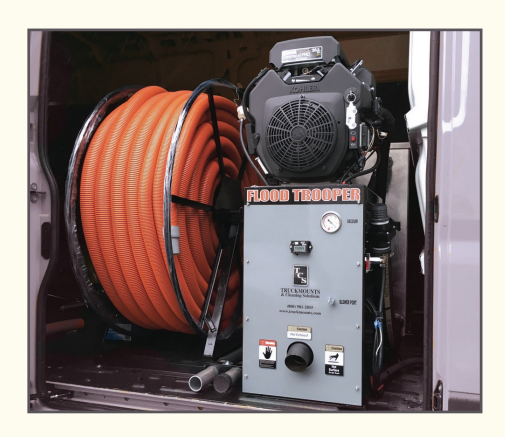
Dual Wand Upgrade Kohler 26.5 EFI - 4L DSL Blower